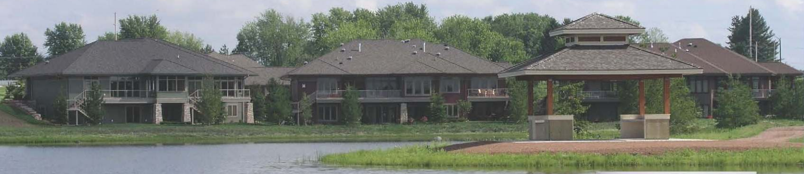
Prairie Lake Source for geothermal heating & cooling